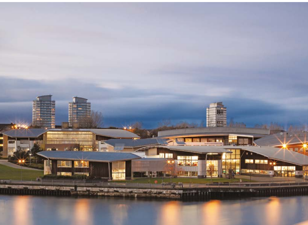
Sir Tom Cowie Campus at St Peter's