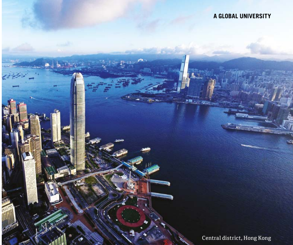
Central district, Hong Kong