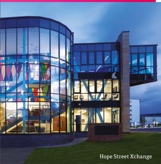
Hope Street Xchange