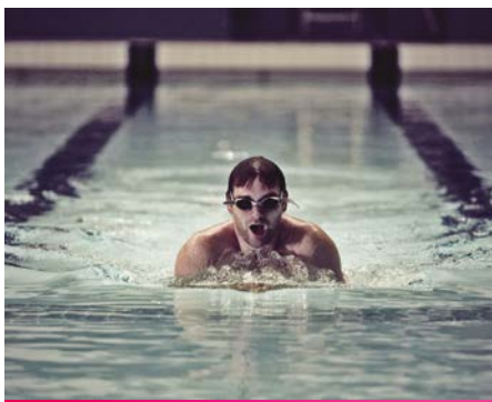
Sunderland's 50m swimming pool

As well as our excellent gym and sports provision on campus, you can also get involved in sports like tennis, badminton, football and squash. Or for something a bit different, why not give martial arts or trampolining a try?