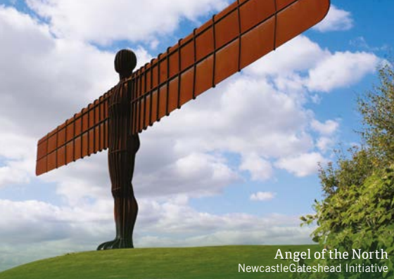
Angel of the North NewcastleGateshead Initiative