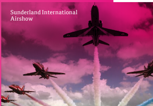
Sunderland International Airshow