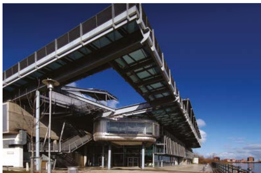
National Glass Centre

Discover the Northern Gallery for Contemporary Art at the National Glass Centre.