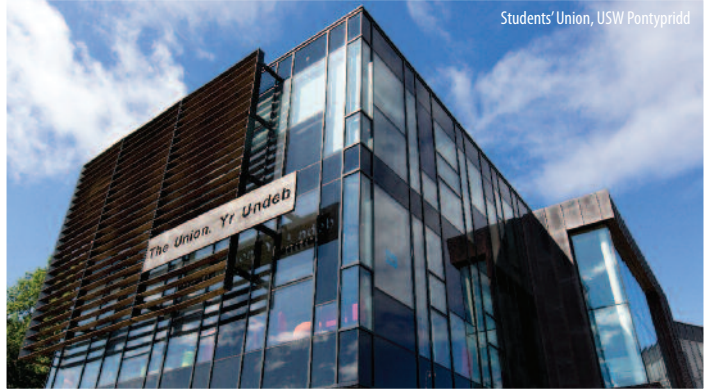
Students' Union, USW Pontypridd

Whether you want to socialise or just someone to talk to, the Students' Union will support you.