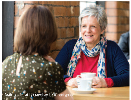
Grab a coffee at Ty Crawshay, USW Pontypridd

We have accommodation options available at all campuses for students. Pontypridd offers Halls of Residence and student flats, and Cardiff and Newport have privately run student accommodation. These rooms have been reserved for USW students so you can live close to other students on your course. We can also help find private houses to rent. Visit: southwales.ac.uk/accommodation