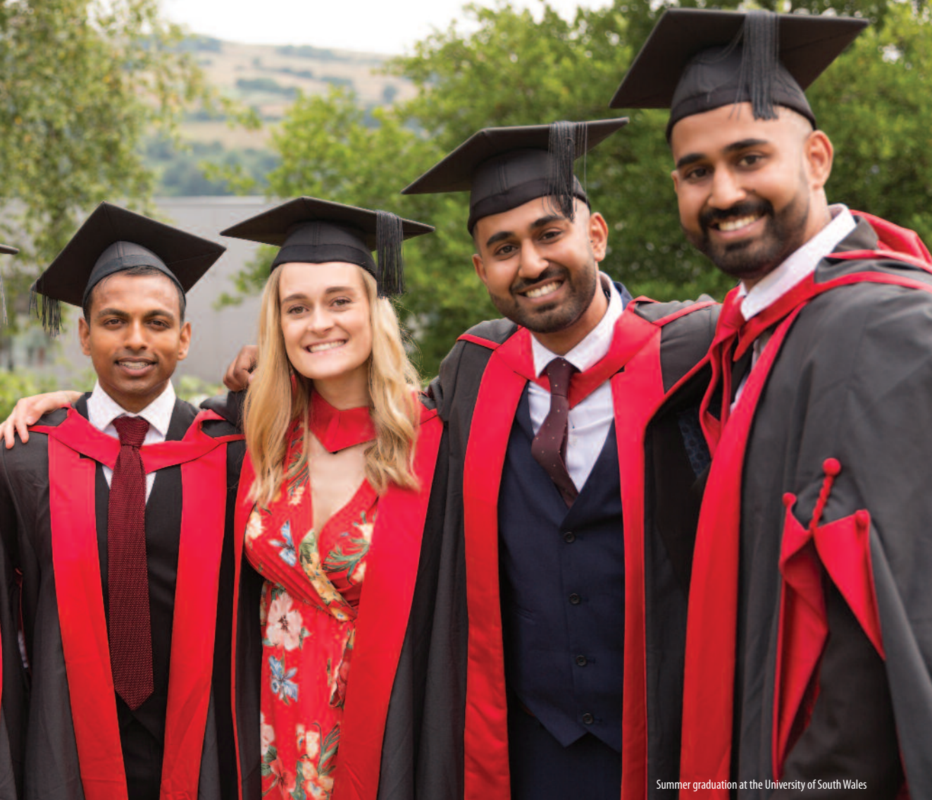
Summer graduation at the University of South Wales

As you graduate, you'll join a global community of more than 250,000 alumni – a ready-made network of like-minded peers and potential contacts. Building on friendships made during your time as a student, you will have the opportunity to establish lifelong connections through a wide range of opportunities and initiatives.