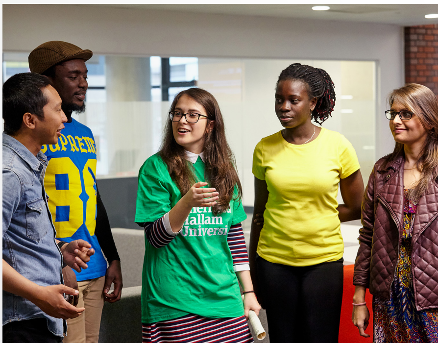
An international student ambassador taking students on a campus tour during Welcome Week.