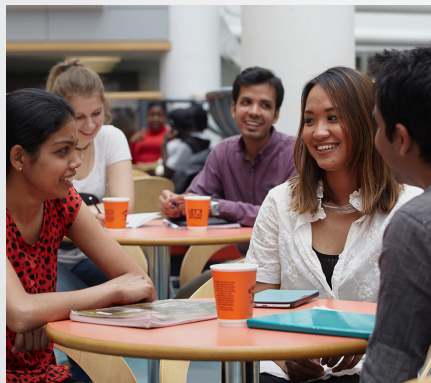
Most halls have a common room where students socialise.