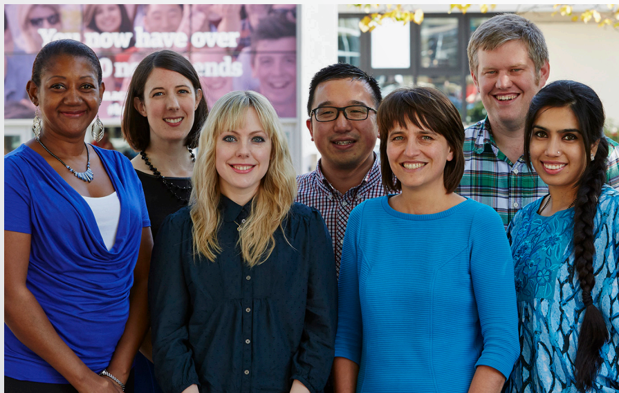
The International Experience Team provide support to all international students in the University.

If you are interested in part-time work, visit Careers Connect for advice and support. Visit shu.ac.uk/current-students/careers-and-employability