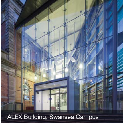
ALEX Building, Swansea Campus